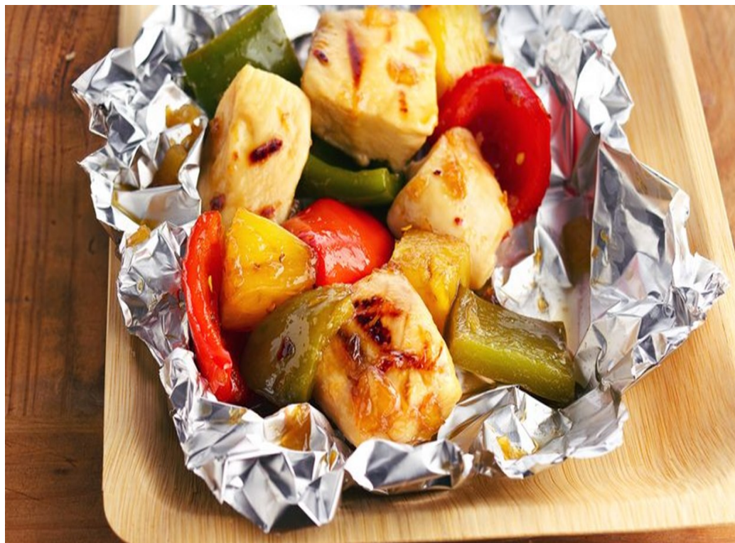
Grilled Pineapple-Chicken Foil Packs by Betty Crocker Kitchens submitted by Clinical Nutrition